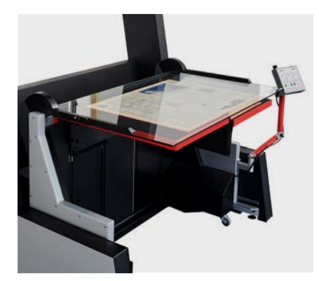
Wide range of interchangeable imaging systems