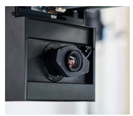
Camera system based on a CMOS sensor