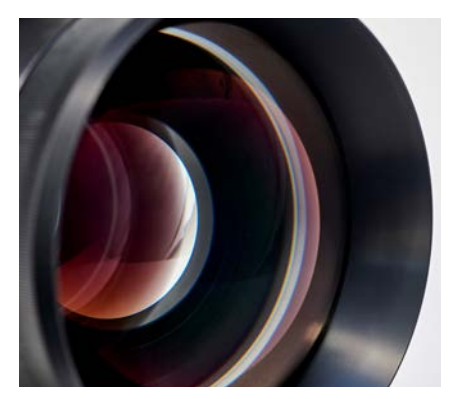
Perfect interplay between high-quality technical components