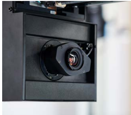
Camera system based on a CMOS sensor