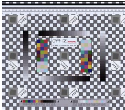
Fulfills ISO 19264-1 Level A, Metamorfoze Full and FADGI 4 Star