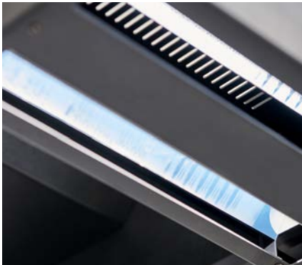
LED lighting system for reflection-free and shadow-free results