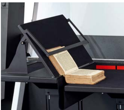
Bookholder on Copyboard OT 180 H 35 XL