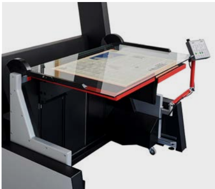
Wide range of interchangeable imaging systems