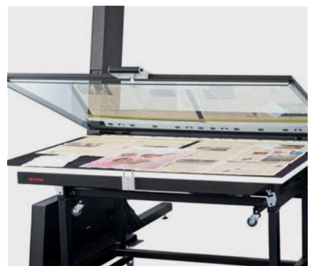
Toplight Table AT 0 with opened glass plate